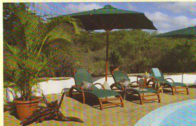
FH's kidney Shaped Pool and Sundeck offers you privacy from the game.

The Bar/Lounge comprises three areas of comfortable private seating - a favourite being the mezzanine library overlooking the dining hall. Denys' Bar is supported by a well stocked cellar offering the gambit of European, American and South African wines along with traditional spirits. Cuisine and service are to the highest European standards. It all begins of course in FH's 'state of the art' kitchens offering undreamt of hygiene in the bush. The courses are exquisitely presented and a delight to consume - delicate soups, main courses, followed by continental desserts - all from FH's in-house patisserie.