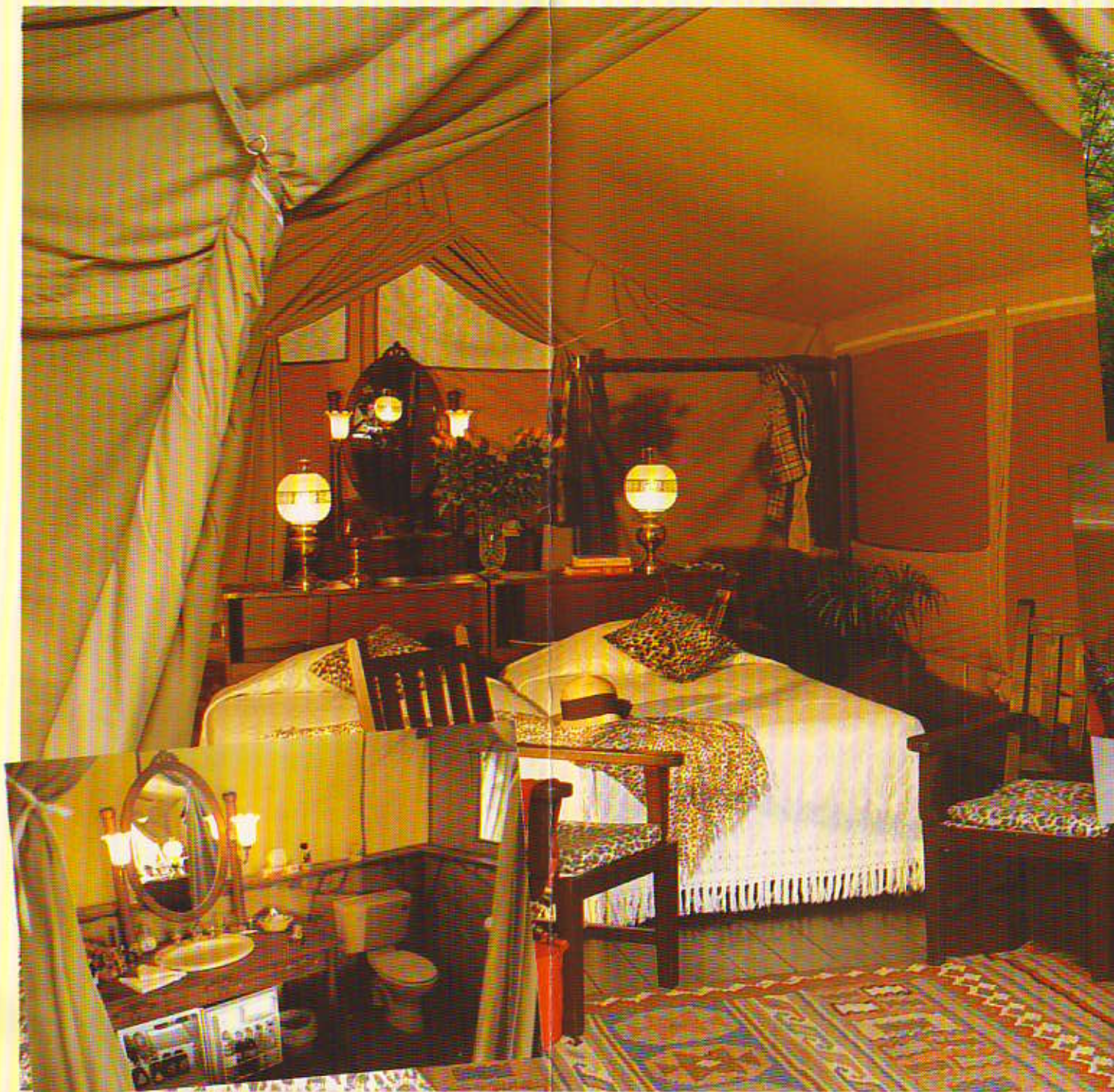
FH - Generously Appointed Bathroom

Now you can enter this rather different world and enjoy a fresh perspective.