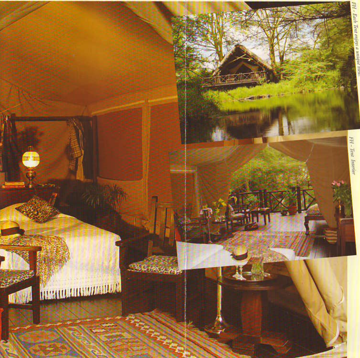
FH - Each Tent enjoys a unique view!