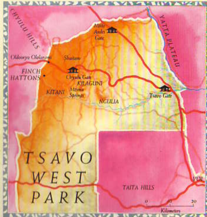
Aerial Photography - Aircraft Courtesy of East African Air Charters, Wilson Airport, Nairobi.

The most convenient way is by Light Aircraft to our all weather airstrip, the Heliport just outside the Camp; or by road entering Tiavo West from Mtito Andei Gate, head for Kilaguni, then Kitani. Alternatively exit Chyulu Gate, turn left after 15 kms and follow the road 9 kms to the camp.