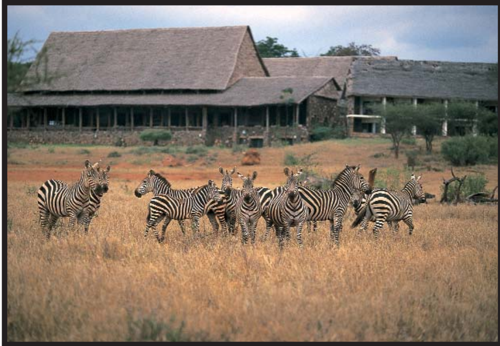
Spectacular terrace game view

Located on a ridge that commands magnificent sweeping views of the Chyulu Hills at the foot of Mount Kilimanjaro, Kilaguni was the first safari lodge ever to be built in a national park and has long been a favourite of international tourists. It was opened in 1962 and has been under Serena management since December 1999.