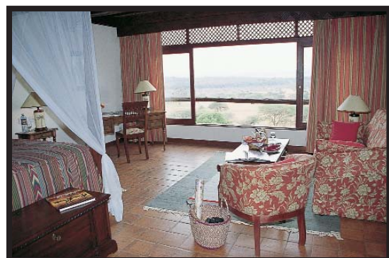
Room with a view